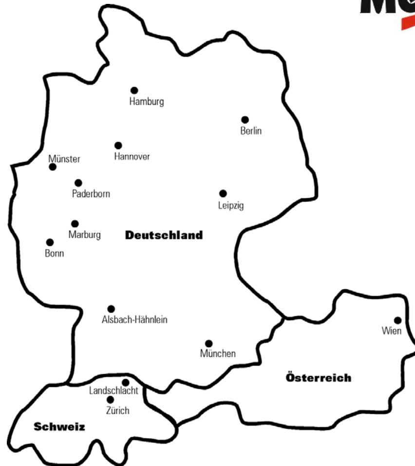
Map of Germany, Austria and Switzerland with locations of MEDIBUS-libraries